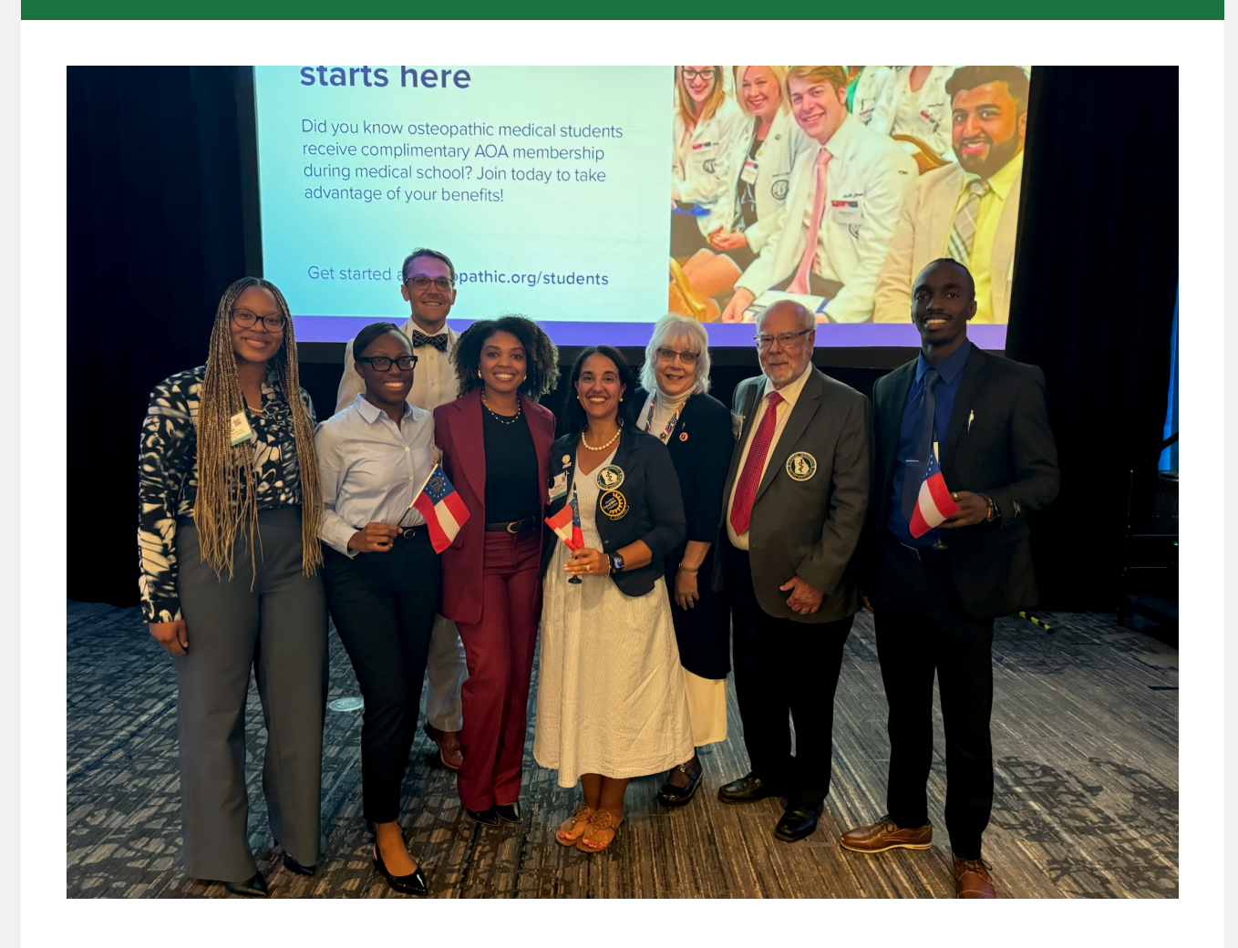
GOMA Sent Delegation to AOA House of Delegates in Chicago